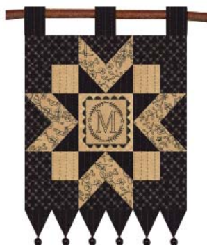
Monogram Banner 12 x 16