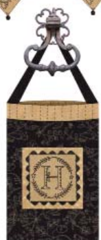
Door Knob Caddy 9 x 6