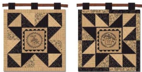
Spring 16 x 16