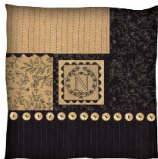
Pillow 14 x 14