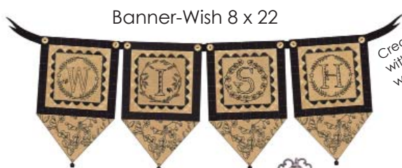
Banner-Wish 8 x 22