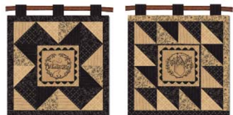
Winter 16 x 16